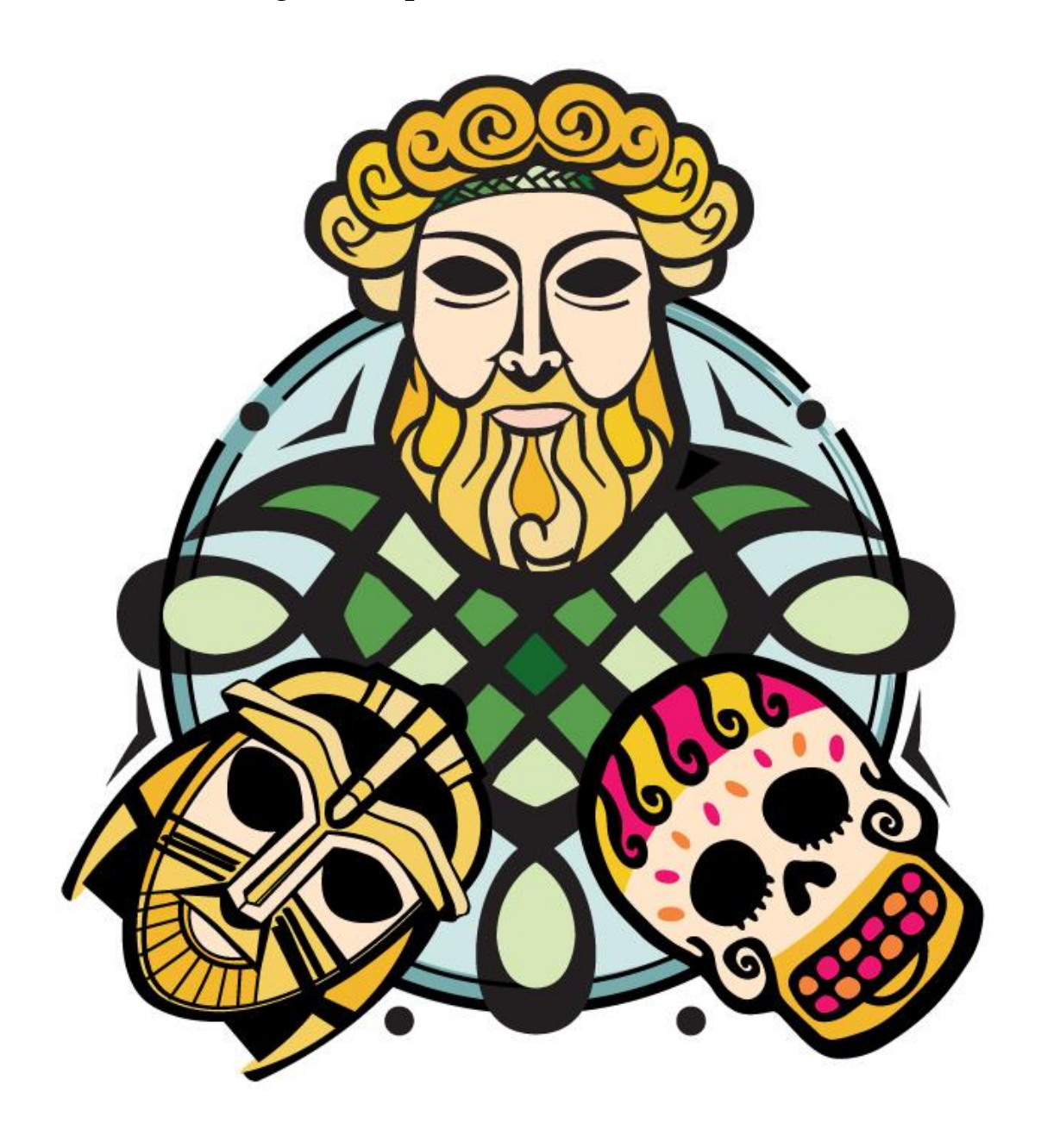
August 5–8, 2016 // San Antonio, Texas www.mythcon.org

Faces of Mythology: Ancient, Medieval, and Modern Progress Report 1 – March 20, 2016